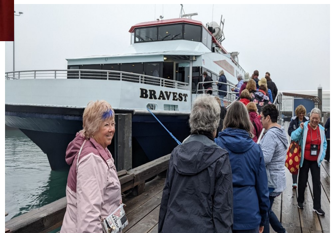
Right: Boarding the boat for a wildlife and glacier-viewing cruise on Whittier Sound