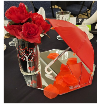
The lovely table decorations at WSR were provided by GFWC of Central Oregon, GFWC Oregon City and GFWC Beaverton