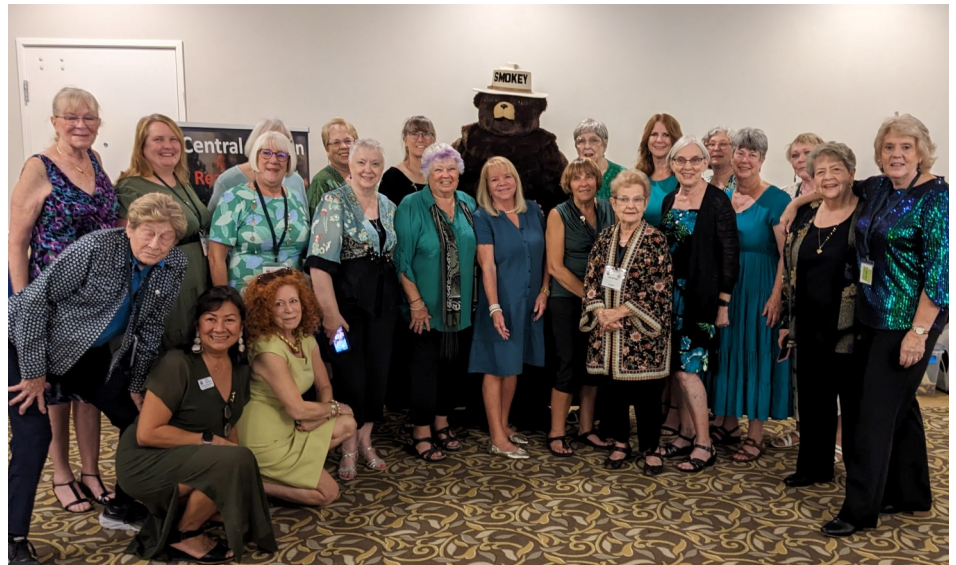
OFWC members gather on State Night with special guest Smokey Bear