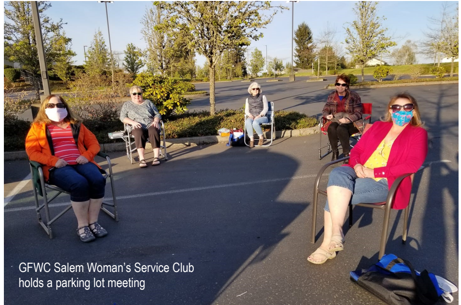
GFWC Salem Woman's Service Club holds a parking lot meeting