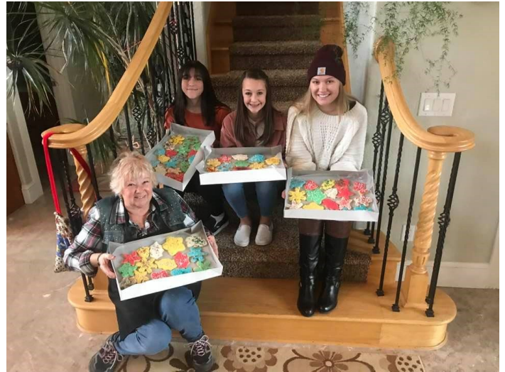
Central Oregon Juniores—making and decorating cookies for Meals on Wheels