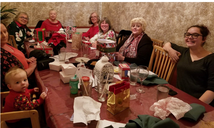
Polk County Service Club Holiday Party