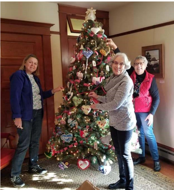
Oregon City Woman's Club—decorating a tree at Stevens Crawford House and making blankets