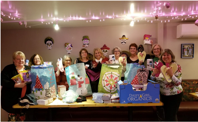
Salem Woman's Service Club Holiday Party—collecting items for local woman's shelter