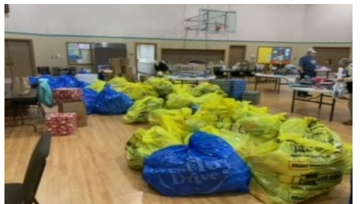
Silverton Zenith Woman's Club Tree of Giving: A community project that provided toys and clothing to 254 children in Silverton.