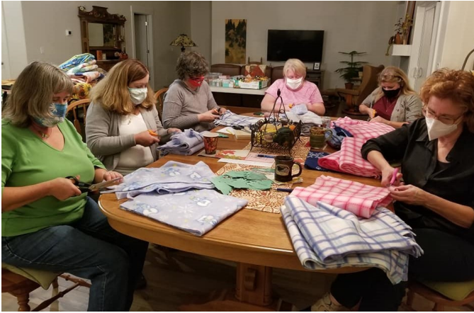
Salem Woman's Service Club making stockings for residents at local assisted living center