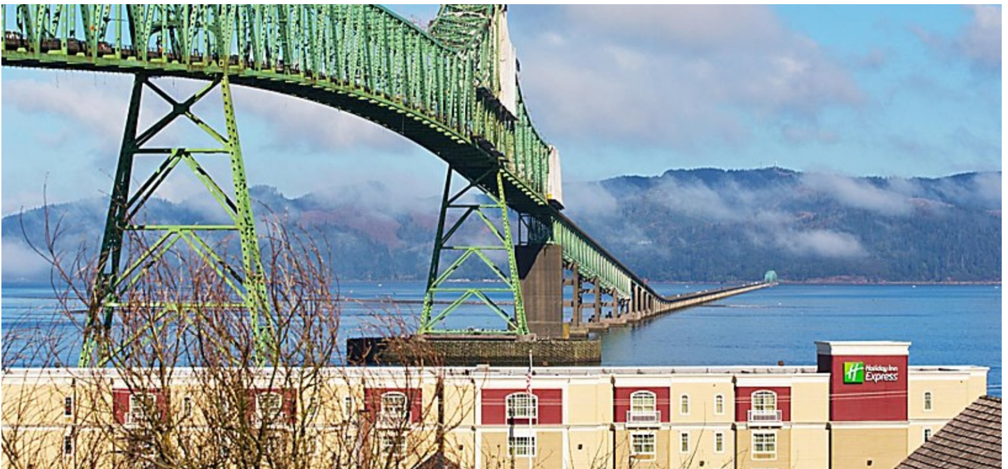
Holiday Inn and Suites, Astoria, the site for our 2021 OFWC Convention.

You will be notified should it be determined that it will not be possible or safe to hold the convention.