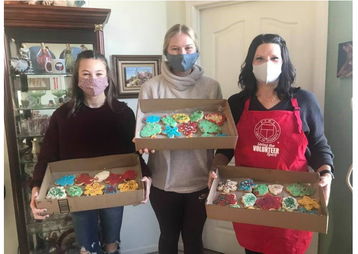
Central Oregon Juniorettes—baking and