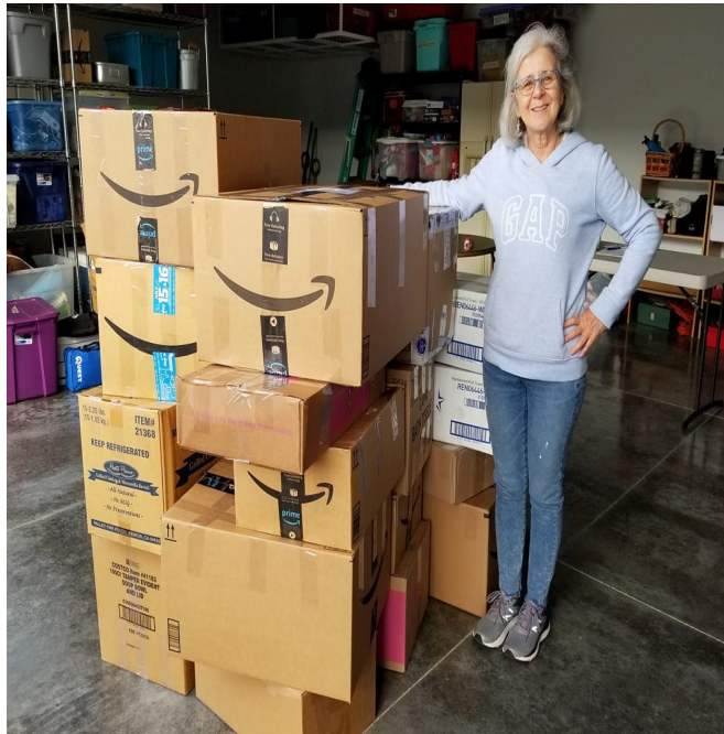
Central Oregon Juniores assembled tie quilts for the local Domestic Violence Center-Saving Grace. A fun project that brings happy smiles to the children of victims!